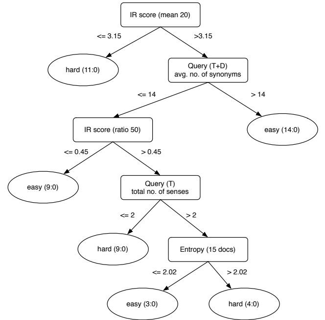
Figure 2: Decision tree related to ok8amxc

For example, when removing all measures related to the ratio of the retrieval system’s document scores ( IR score (ratio N) ) which are prominently used in the example above,